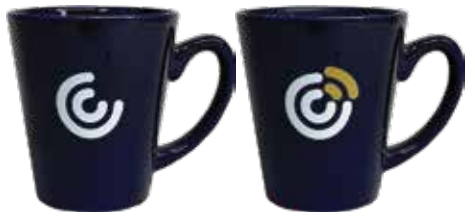
815-50 2 Spot Colors - Cobalt Vanish-Ink