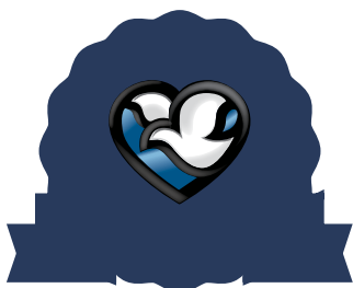
With Vanish Ink