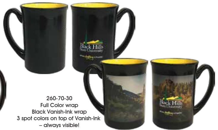
260-70-30 Full Color wrap Black Vanish-Ink wrap 3 spot colors on top of Vanish-Ink - always visible!