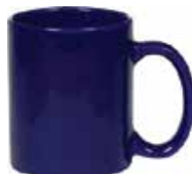
Cobalt Blue 100-50