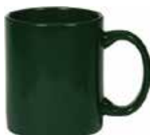
Hunter Green 100-43