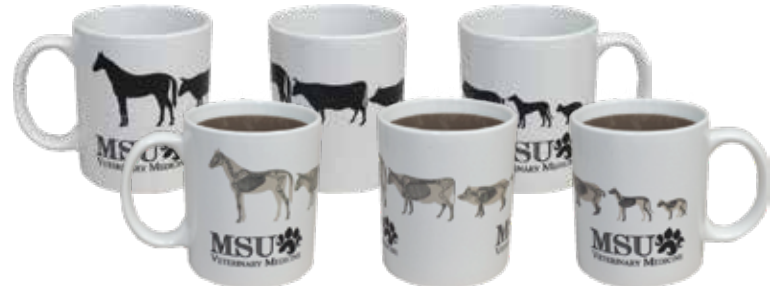
100-00 - 1 spot color wrap - Black Vanish-Ink with precise registration

Please provide your art file for pricing and suitability review.