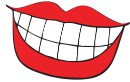
Without Vanish Ink