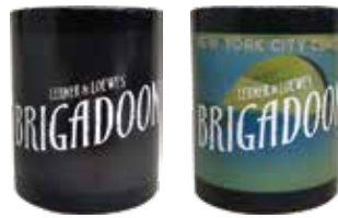
100-70 - Full Color wrap, Black Vanish-Ink wrap 1 spot color on top of Vanish-Ink - always visible!