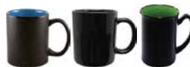
125 Series 180 Series 260 Series

Other great mugs to use with Vanish-Ink: