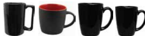
600 Series 816 Series 840 Series 845 Series