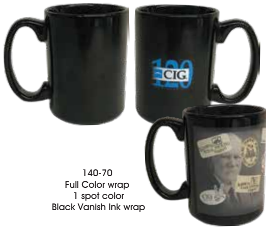
140-70 Full Color wrap 1 spot color Black Vanish Ink wrap