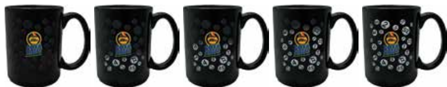
140-70 -- Lottery numbers appear when mug is hot

This works well when the Vanish-Ink matches the color of the mug.