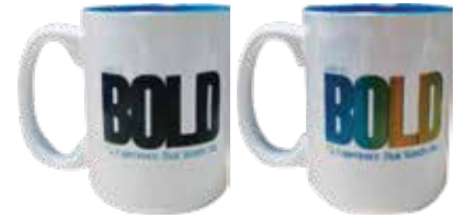
140-00-52 FCP, 1 spot color - Black Vanish-Ink